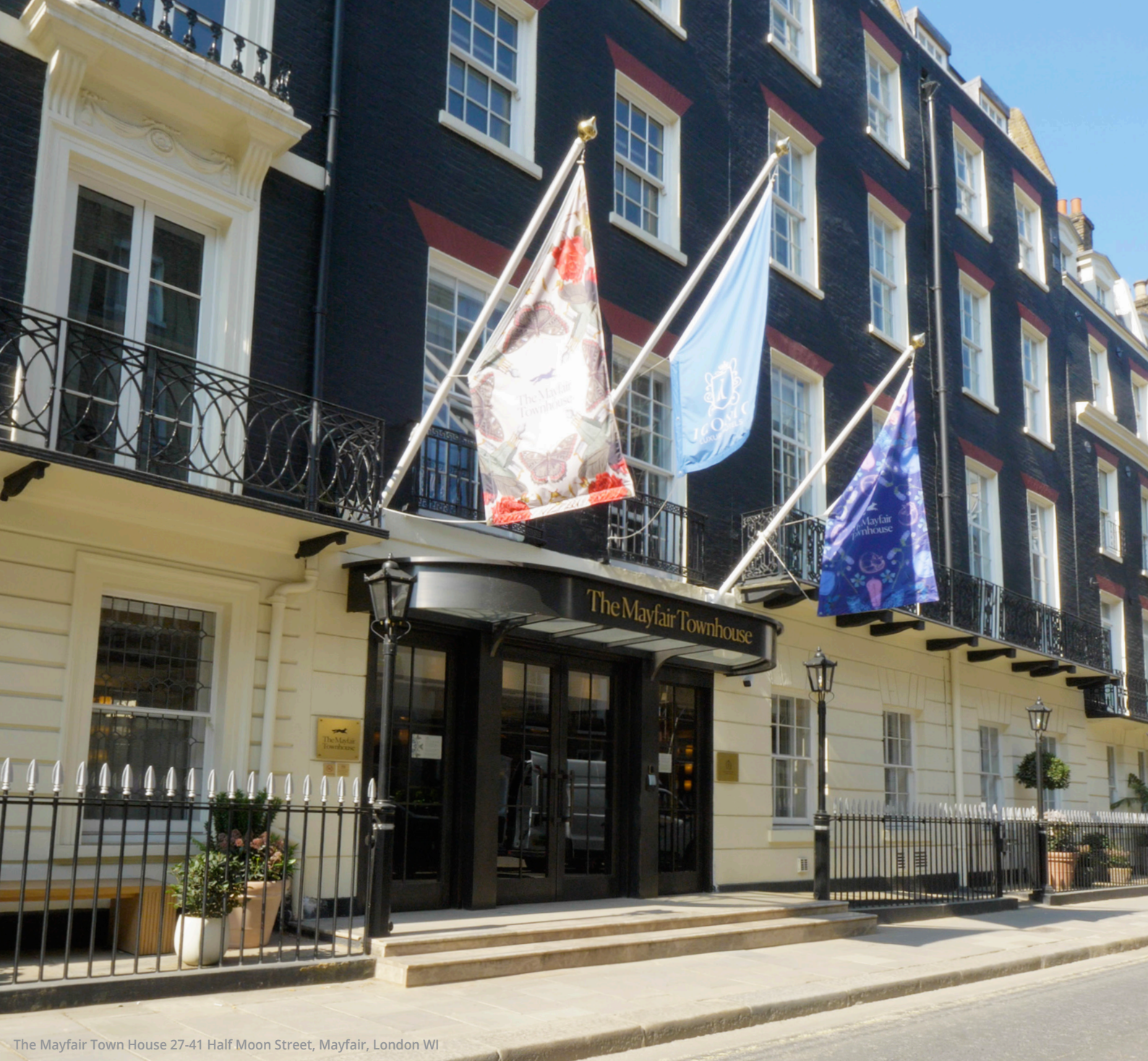
The Mayfair Town House 27-41 Half Moon Street, Mayfair, London W1