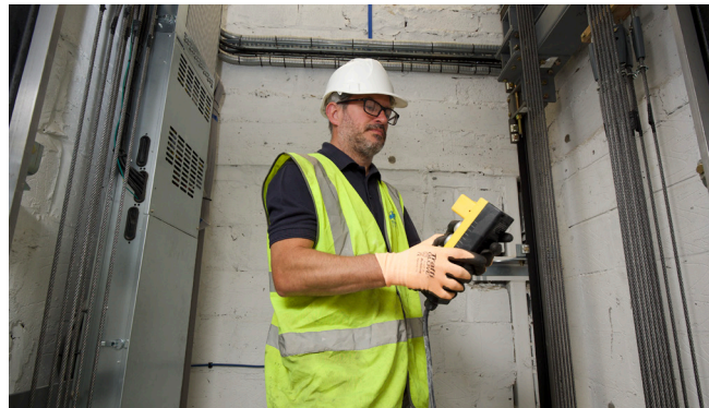
Above images: Testing