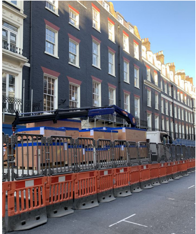
Delivery Day 2020

The two Hitachi ON1 lifts arrived in the UK early 2020 during the first COVID lockdown period so great care was taken to closely follow Government Social Distancing guidelines. We also strived to assist L&R Hotels with their programme dates and worked on site in strict isolation from other trades to minimise any risks to our installation team.