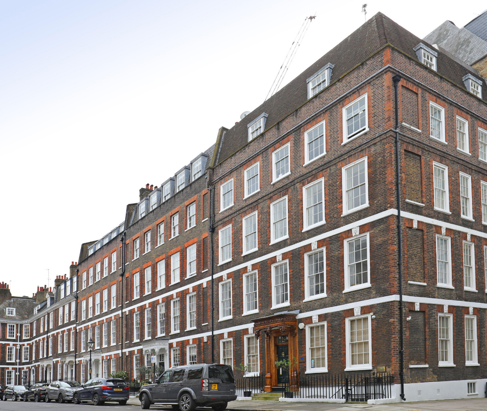
Typical Georgian town house, London SW1